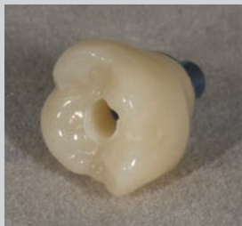
Ti Base with Provisional PMMA crown...$ave

Ti Base with e.max® or Bruxzir® crown (Includes Model and Analog as shown)... Call for our Low Price.