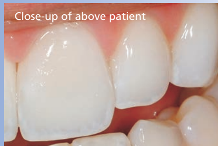
Close-up of above patient