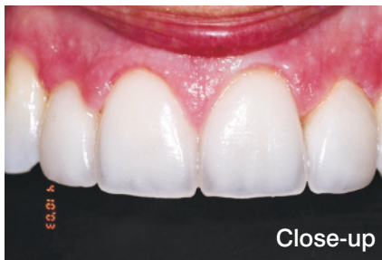
Case prepared and seated by Dr. Kuljic, Beverly, Ma. Shofu Halo Opal All-Ceramic #8 & 9 Jacket Crowns, #7 & 10 Veneers. Fabricated by Killian Dental Ceramics, Inc.

translucent porcelain. Preps with stump shades that closely match the desired finished restoration shade can be prepped more conservatively (0.5 mm).